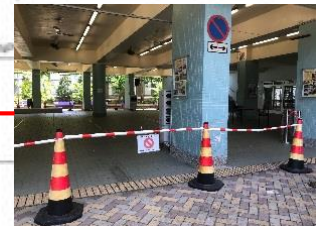
⑦ Extra buffer zone