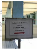
④ Direction Signpost