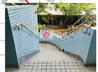
⑥ Fencing line

① Net on BOTH sides (1 layer of JVD Netting White Standard, Dimension: L 18m x H 3.2m, Weight: 300 gram/m 2 )