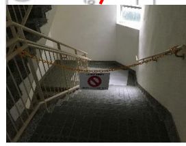
⑨ Warning Signpost & Fencing line