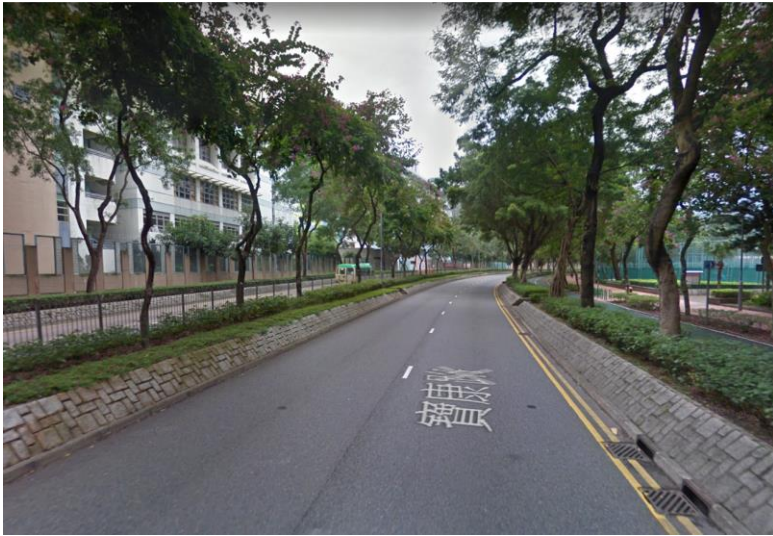
Po Hong Road